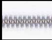
Matt White Bronze