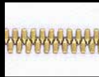
Light Antique Gold